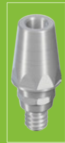
implant shoulders \varnothing 6.5 mm WN (048.606)