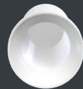
....and rotation for bridges