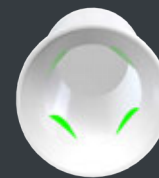
Inner geometry of coping enables casting rotational lock for crowns.....